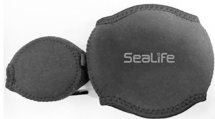
Neoprene lens cover