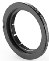
52mm DC adapter