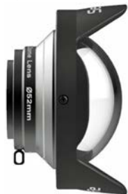
Wide Angle Dome Lens (with 52mm thread mount and lanyard with clip)