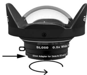
Attach 52mm DC Adapter (SL977) to the lens.