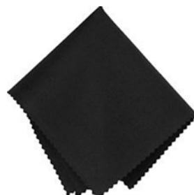
Micro fiber cleaning cloth