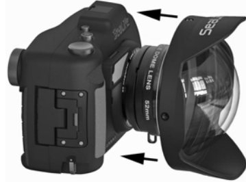
Align the lens with the lens port of the SeaLife DC-series UW housing and push until it press-fits on to the port.