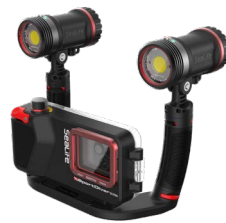
SportDiver Ultra with Sea Dragon Duo 10K+ light set

As the leading manufacturer of underwater smartphone housings, SeaLife is constantly testing and adding more features and functions by their app and housing developments, as well as universally fitting accessories that let you grow your underwater imaging results. If your passion takes you to new depths, or to a larger phone; consider the SportDiver Ultra, the slightly larger, deeper diving housing that includes some added features (see table below).